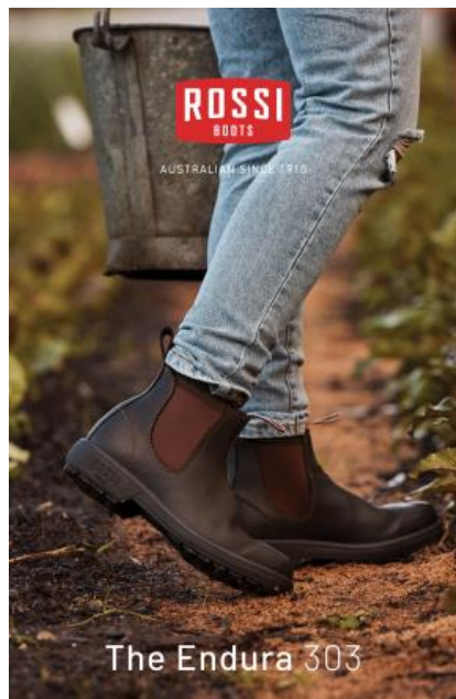
The Endura 303

Disease risk was always going to be elevated this season as growers considered how ...cont page 2/